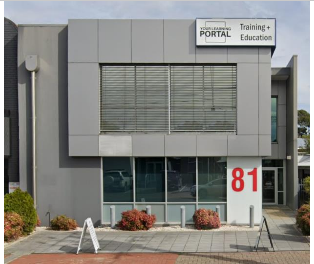
Level 1, 81 Fullarton Road, Kent Town 5067