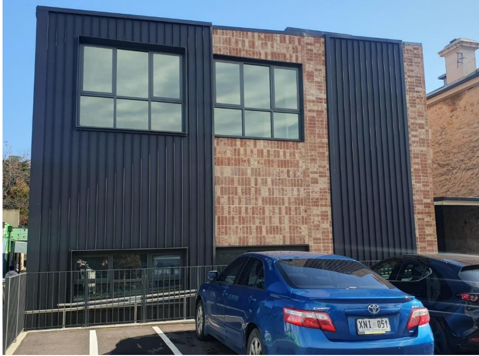
2/27 Mount Barker Road, Stirling 5152